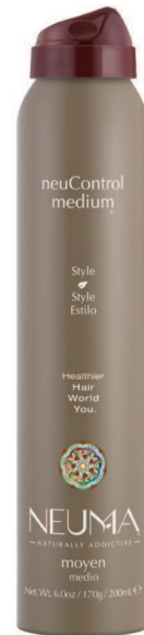
Available in 6.0 oz