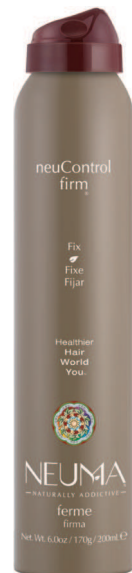
Available in 6.0 oz