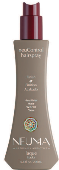
Available in 6.8 oz